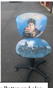
Harry Potter and also one with Sponge bob

CHECK OUT OUR Donation Page at www.stneotstimebank.org.uk Members have donated items - and we are passing on this offer to our members. No charge for many of the items, cut price for others.