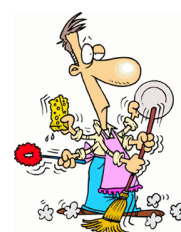
Time for spring cleaning!

Time Banks are built around reciprocation. It cannot work with members simply offering to help others in the community. It is there to give people the confidence to ask, and sometimes that is not an easy thing to do. By giving this challenge it makes us all think about the spare time we have and how best to use it, or by asking someone to help you could gain some spare time for yourself.